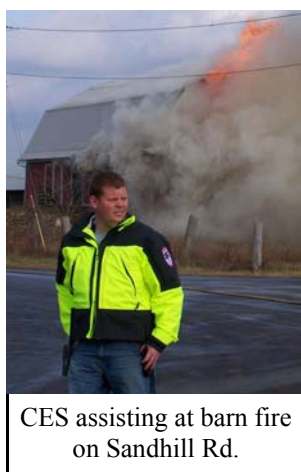
CES assisting at barn fire on Sandhill Rd.