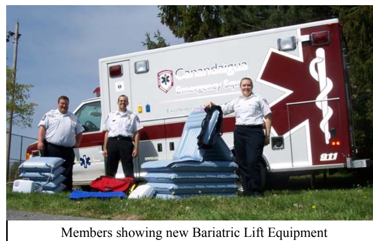
Members showing new Bariatric Lift Equipment