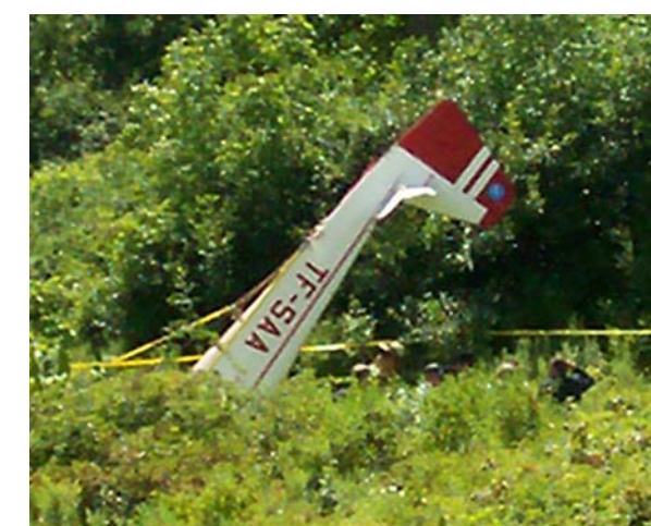
CES Crews first on the scene of glider crash at Canandaigua Airport

Thank you to our donors who help us maintain our high level of service! For assistance with any donation questions, please call (585) 394-5860.